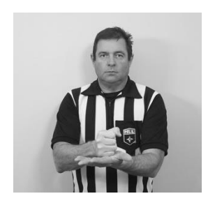
Intentional Dead Ball Contact