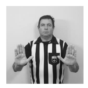
Checking from Behind