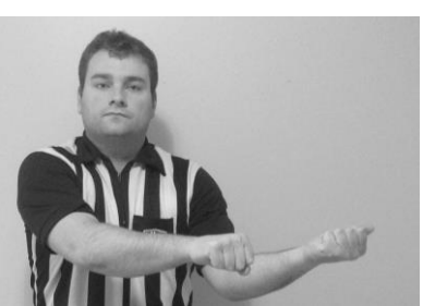
Holding the Stick