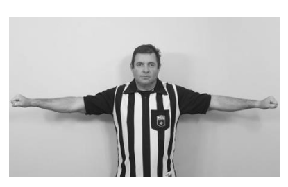
Delay of Game