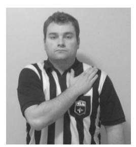
Illegal Body Check