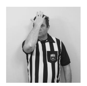
Head Butting/Spearing with the Head