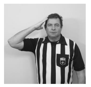
Dangerous Contact to the Head