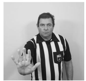
Loose Ball Push