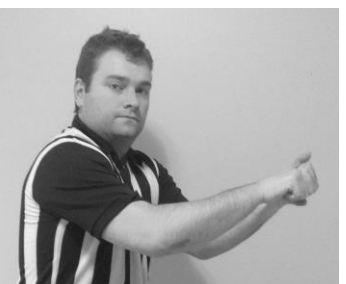
Ball Batted In